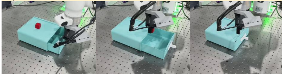
1) Place Block in Drawer